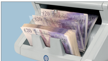
HIGH-SPEED COUNTING OF SORTED BANKNOTES