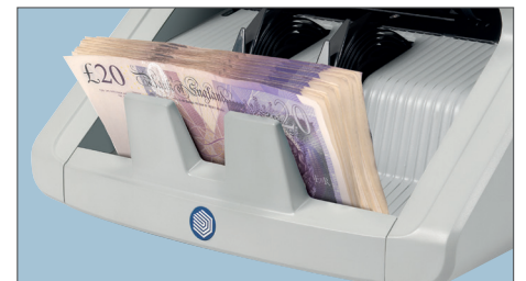
ADJUSTABLE BATCH FUNCTION FOR CREATING EQUAL STACKS OF BANKNOTES