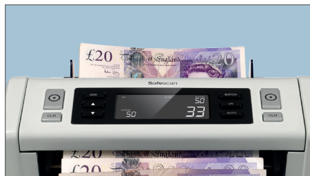
UV COUNTERFEIT DETECTION